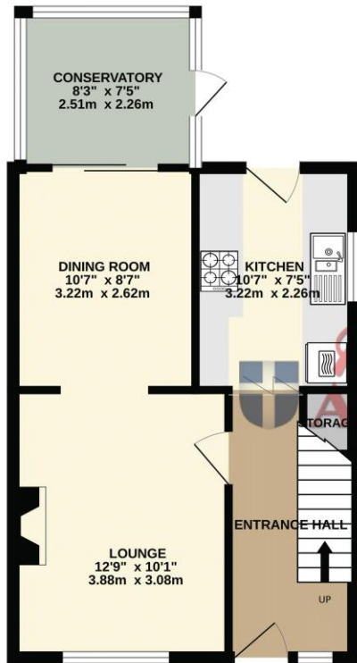
GROUND FLOOR 427 sq.ft. (39.7 sq.m.) approx.