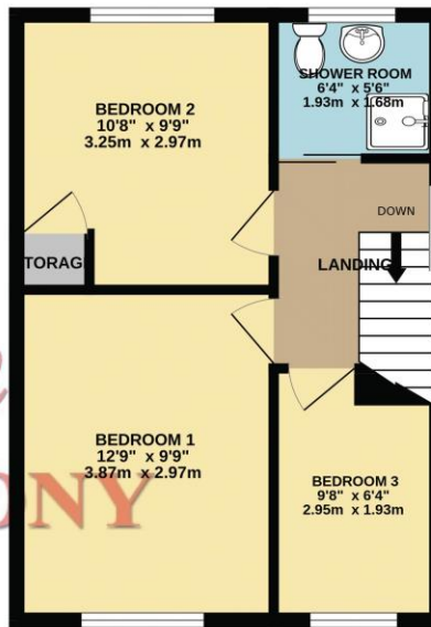
1ST FLOOR 367 sq.ft. (34.1 sq.m.) approx.